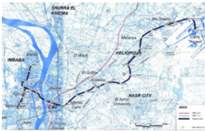
Cairo Metro Line No.3

Line 3 will extend from the north west of Greater Cairo at Imbaba to the north east at Heliopolis serving also the Cairo International Airport.